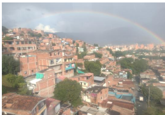
Rainbow over Medellín, Colombia

(ctrl+click on the underlined words above, to read the whole article)